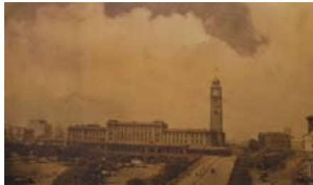
40. Anon. [ Central Station, Sydney ], c1920s. Silver gelatin photograph, 57.1 x 100.5cm. Repaired tears and creases, slight stains overall. In original frame.

Annotation reads "Armless artist." Text reads "Painted by an artist without arms."