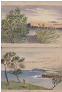
36. Anon. [Sketches Of The Eastern Suburbs, Beaches And Sydney Harbour] , 1908-1913. Hand-sewn notebook of 134 pages containing 40 watercolour sketches, 4 ink and wash and 49 pencil sketches, some with annotations and dates, 13.5 x 10 x 0.8cm (notebook). Some missing portions to cover pages, some pages separated from binding, minor wear to edges, slight foxing overall.