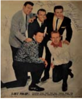
53. 5-In-1 Pinup: Col Joye, Johnny Rebb, Dig Richards, Johnny Devlin and Johnny O'Keefe , 1959. Colour process screen print, periodical format, autographed in ink by all five singers on image, accompanied with original Teenagers' Weekly magazine, 34 x 28cm.