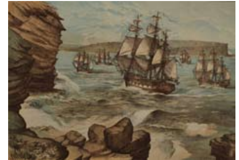
20. After E. Le Bihan . The First Fleet Entering Port Jackson , 1888. Colour lithograph with wood engraving, artist and date in image lower right, text and title above and below image, 46 x 61.1cm. Old folds as issued, minor stains and foxing, repaired tears and missing portions to margins. Laid down on acid-free paper.