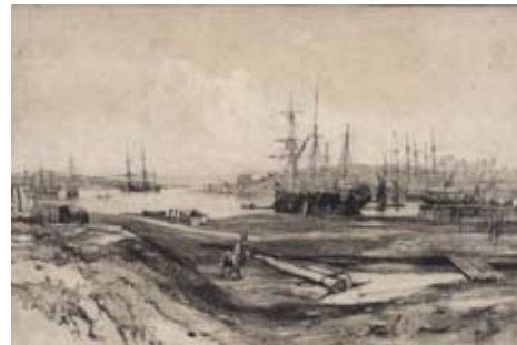
8. John Skinner Prout (British, 1805-1876). Sydney Cove , 1842. Tinted lithograph, signed and dated in image lower centre, 18.8 x 27.9cm. Slight soiling overall, trimmed margins.

Ref: Prout's Sydney Illustrated , 1842-44, plate 8. Held in the National Gallery of Australia collection.