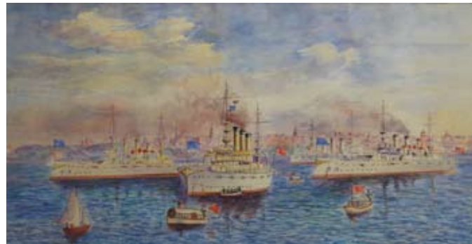
35. Anon. [USA "Great White" Fleet Visit to Sydney] , c1908. Watercolour, annotated "August 1908" in ink in an unknown hand on slip attached to frame verso, 27.9 x 50.5cm. Framed.

to 1903, when he left parliament to become a founding Justice of the High Court of Australia.