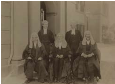
34. Anon. First High Court Of Australia , c1903. Albumen paper photograph, captioned and initialled "R.B." in ink in an unknown hand on backing verso, 14.8 x 20.5cm. Minor chip to upper left corner and retouching to lower left corner. Laid down on original backing.